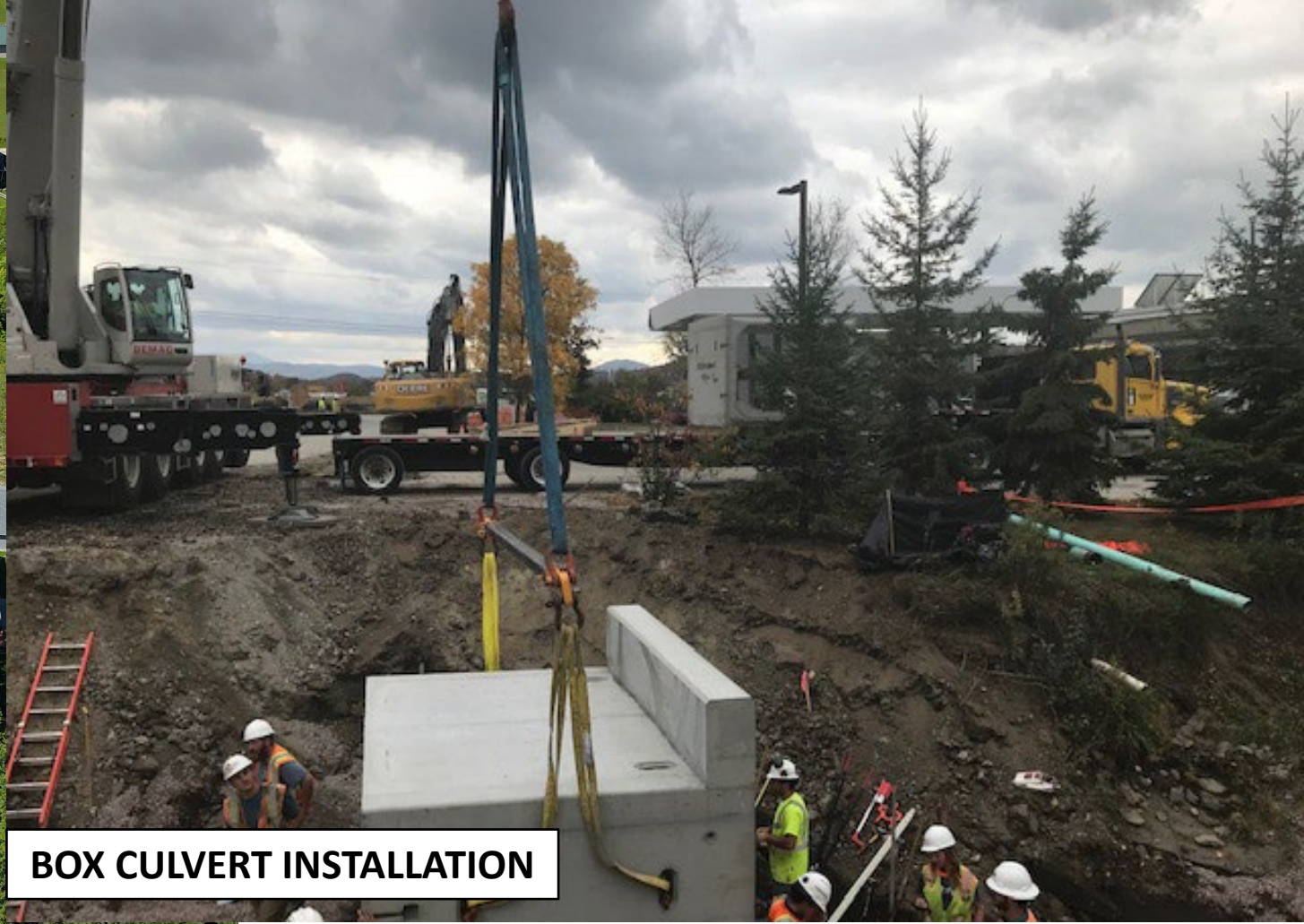
BOX CULVERT INSTALLATION